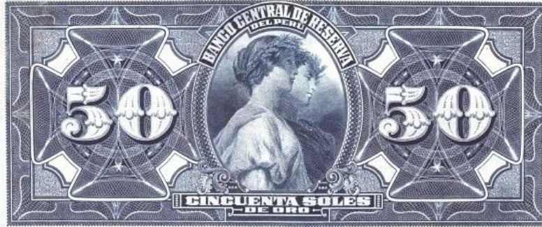
50 PEN, 1933, reverse