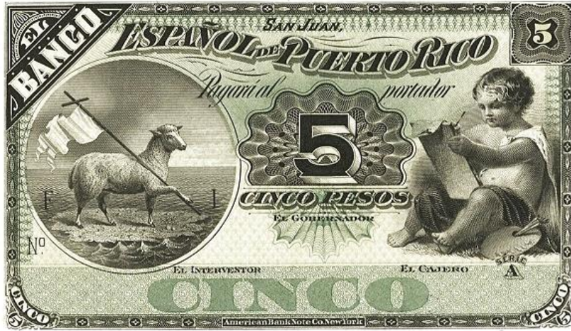
5 Pesos, Puerto Rico, 1889, obverse