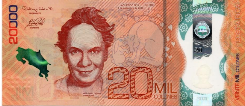
20.000 CRC, 2018, obverse