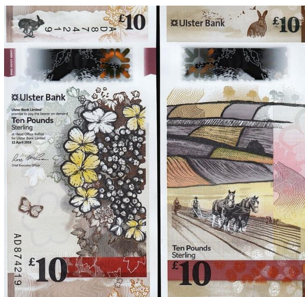
10 GBP, 2018, Ulster Bank, obverse and reverse