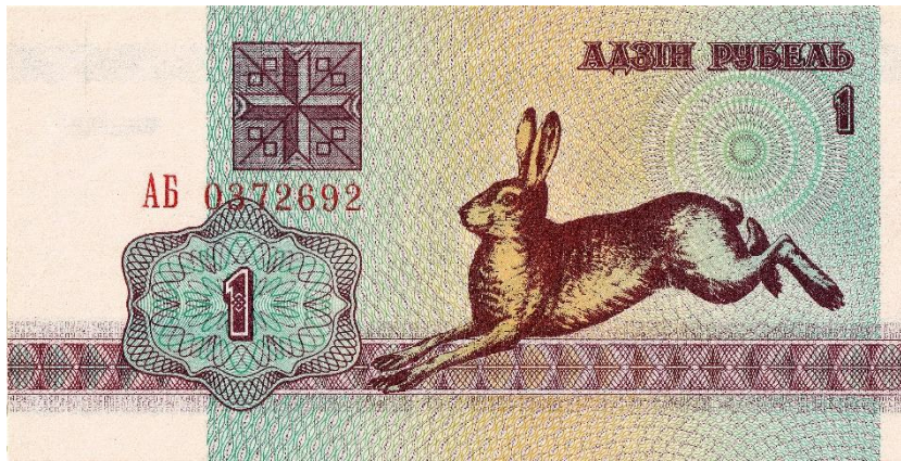
1 BYN, 1992, obverse