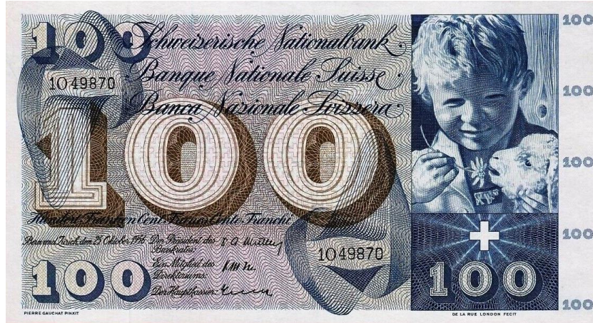
100 CHF, 1956, obverse