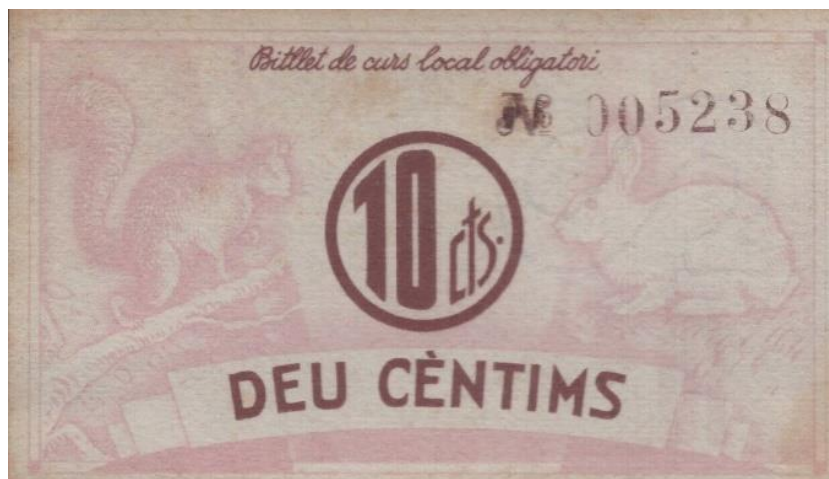
0,1 ESP, Spain (Vallcebre), Notgeld, 1937