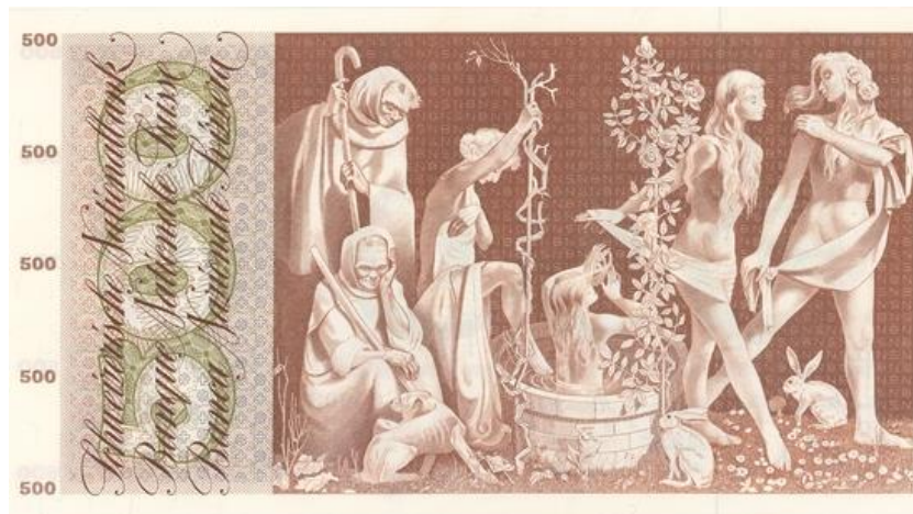
500 CHF, 1957, reverse